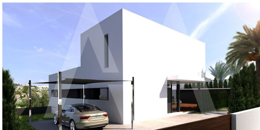
VISTA EXTERIOR 2