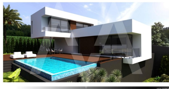
VISTA EXTERIOR 3